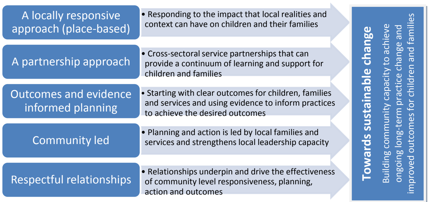
Figure 4.1 Core implementation components (summary)