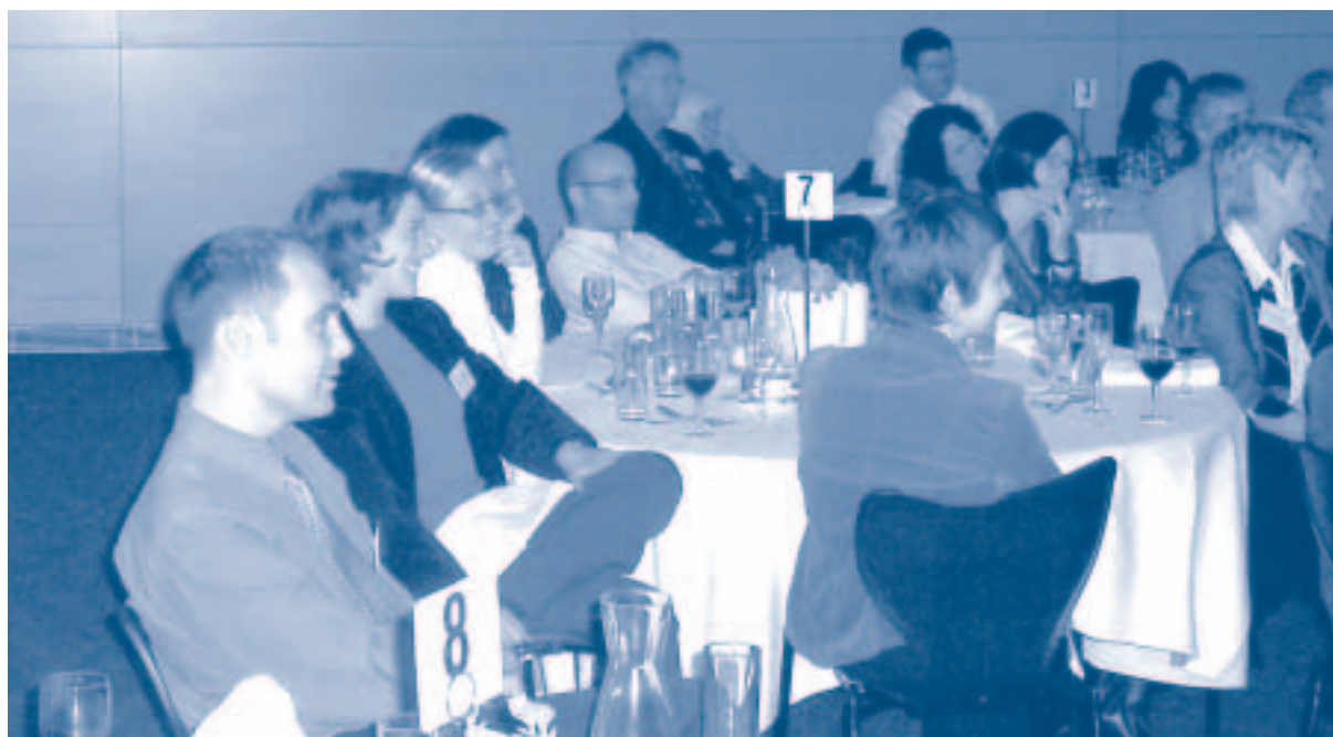
Guests at the SPRC Anniversary Dinner